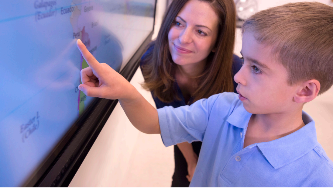
Products shown: Promethean v5 Series